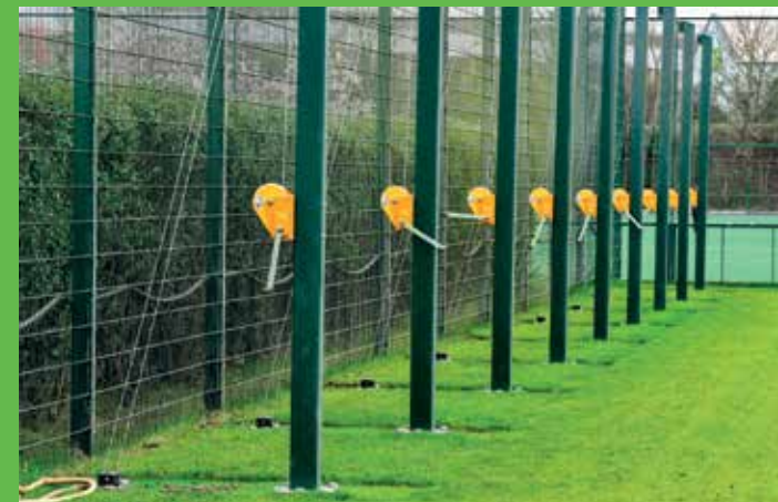
Steel uprights sunk in to concrete allow the wires to be tensioned across play