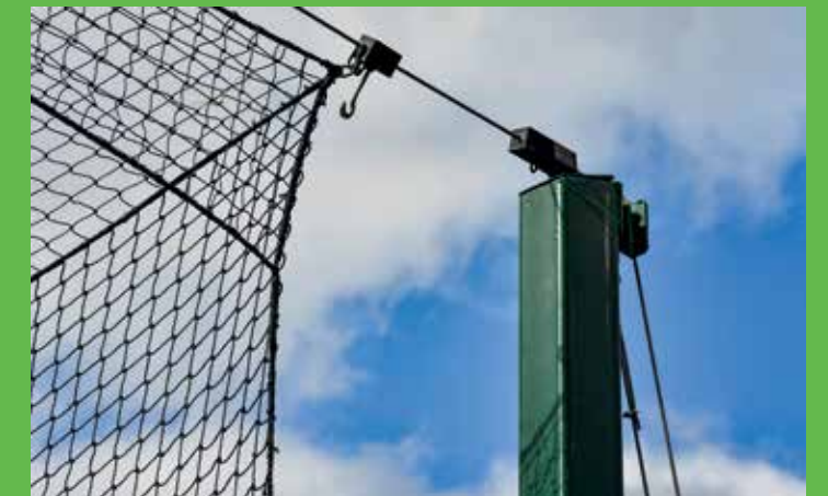
Fully enclosed tunnel netting systems in high quality knotted netting