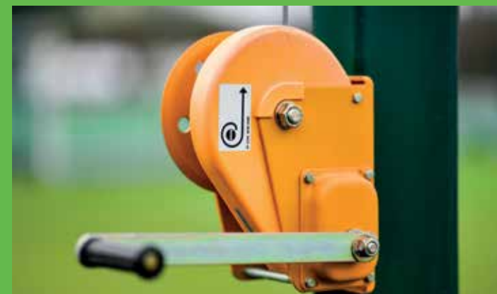
Unique torque winch allows tension to be consistent across all bays