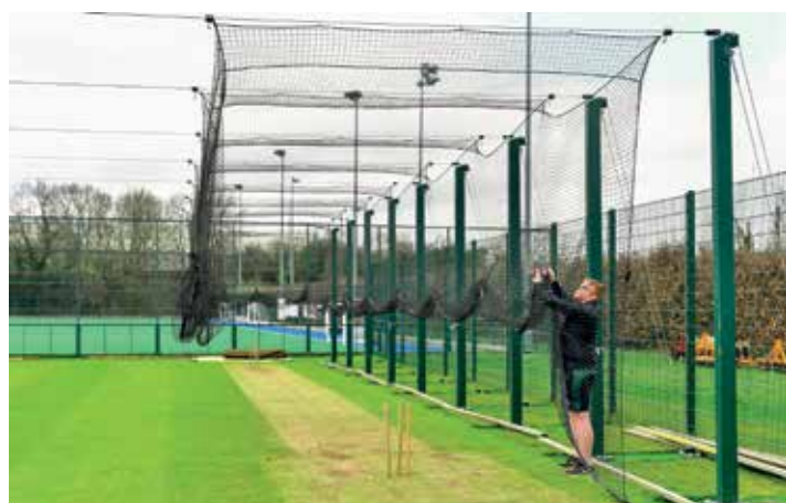
Tying up the nets allows for easy pitch maintenance

system, it makes the work a lot more efficient."