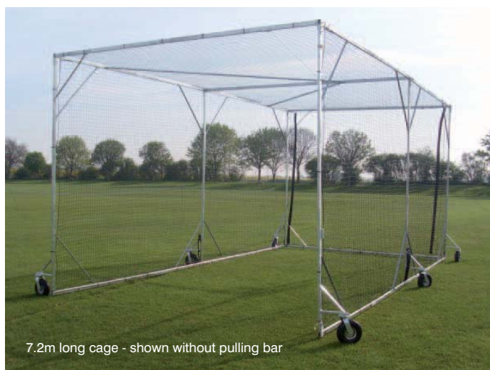
7.2m long cage - shown without pulling bar