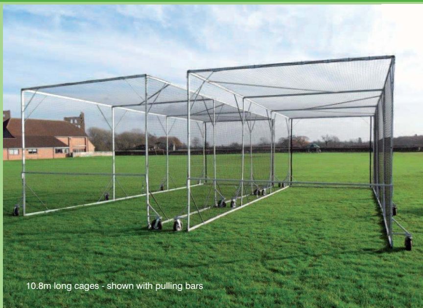
10.8m long cages - shown with pulling bars