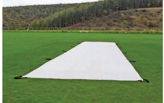
Semi translucent flat sheet cover